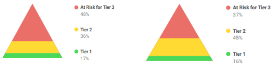
Figure 2: David Paterson Reading Diagnostic Results I-Ready February 2020